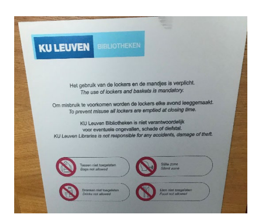
Figure 10: University Library