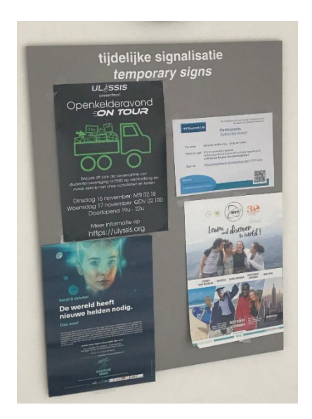
Figure 12: Faculty of Economics