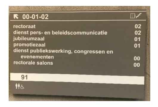
Figure 11: Rectorate