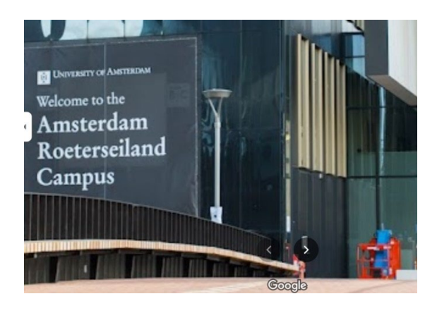
Figure 14: University of Amsterdam