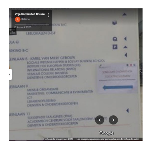
Figure 15: VUB